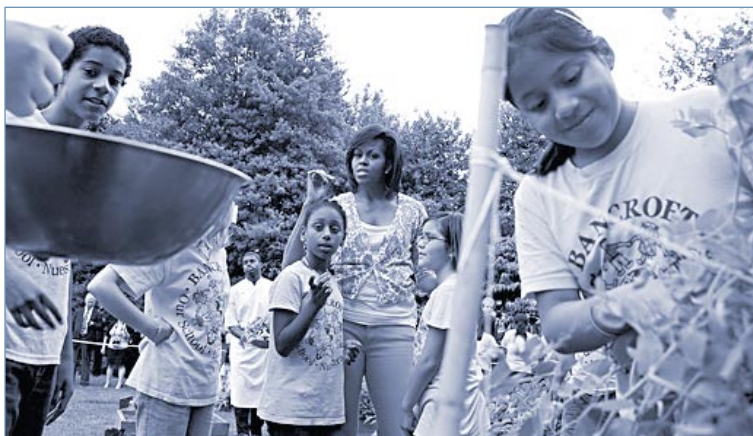
First Lady Michelle Obama and students from Bancroft Elementary reap the rewards of their work earlier this year establishing the White House's organic kitchen garden.

Though the New York Buyers' Club is a nutritional supplements co-op, we understand very well that food is first. The food we eat every day, what kind