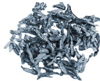
Chinese goldthread rhizome

Coptis Capsules (Zhang) Each bottle, 90 capsules; each capsule, 100 mg of a proprietary extract of Chinese goldthread rhizome.